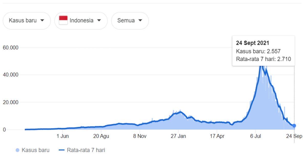
Figure 2. Covid-19 Trend

The management of Covid-19 patients has begun to be handled more systematically since July 2020 both in terms of the availability of isolation rooms, the number of hospitals that accommodate patients, medicines, and medical equipment to other related infrastructure. Although in the third and fourth weeks of January 2021 there was a spike in cases due to the many violations of the health protocol at the turn of the year, the number of active cases was successfully reduced on average every week because the existing institutional readiness was adequate. However, 2 weeks after the Eid homecoming season in mid-May 2021, the spread of the pandemic has become very extraordinary. In contrast to the year-end atmosphere, the mobility of people during the unavoidable holiday moment has caused an explosion after 3-6 weeks later, so that active cases in Indonesia had entered the top 5 in the world in more than two weeks. With the centralization of policies from the government, tightening social mobility, and taking over the command of handling the pandemic in the hands of the president in mid-August, the trend of the number of active cases decreased significantly. The legitimacy of the president as the head of the state removes various doubts from the statements of high-ranking officials who are suspected of being driven by various group interests. The government responded to this improved condition by issuing a policy of easing some restrictions on social mobility.