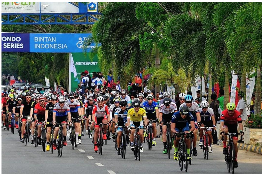
Figure 1. One of the international-based tourist events