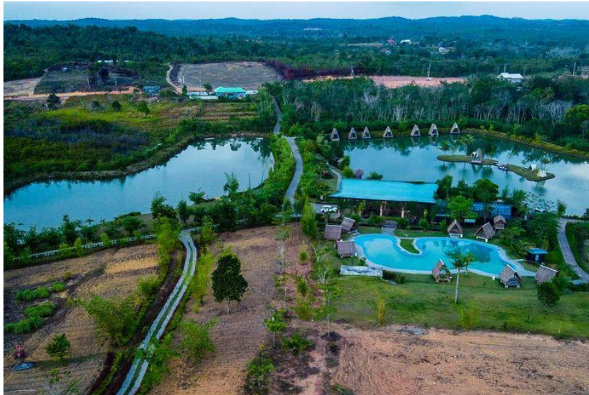
Figure 3. Potential of tourism village by Anculai village community, Bintan district

things that indicate this include the limited understanding of the community towards tourism and tourism awareness (including sapta charm ) which results in attitudes and behavior of people who do not care about tourism. This can be seen in the attitudes and behavior of people who are offensive / aggressive towards tourists in offering products and services, the ODTW environment is dirty, unorganized, and does not provide a comfortable atmosphere for tourists. In addition, support for incentives and facilities from both government and private institutions for people who are going to travel is still limited.