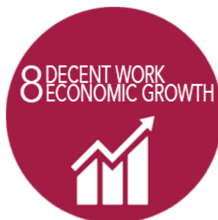
Figure 2. Pillar 8 th in SDGs